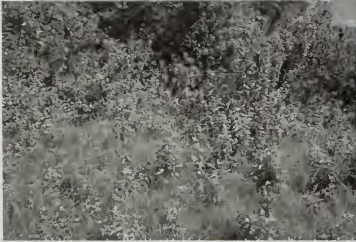
Fig. 1: Place of discovery of the infected spider: Grassland, dominated by tor-grass ( Brachypodium pinnatum ), which is interspersed with dogwood ( Cornus sanguinea ). – Photo: M. Meyer, June 2013

characterized by pine-forests, shrubs or barren calcareous sunny slopes.